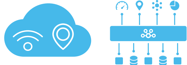
The Mist cloud, featuring a micro-services architecture

Mist's machine learning algorithms monitor network trends in real-time and intelligently alert IT when service levels degrade below defined thresholds. Recommendations are provided for rapid troubleshooting and/or proactive configuration changes.